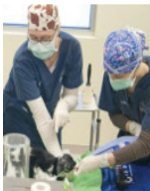
PVSEC Ophthalmology Technicians prepare the lemur for surgery.